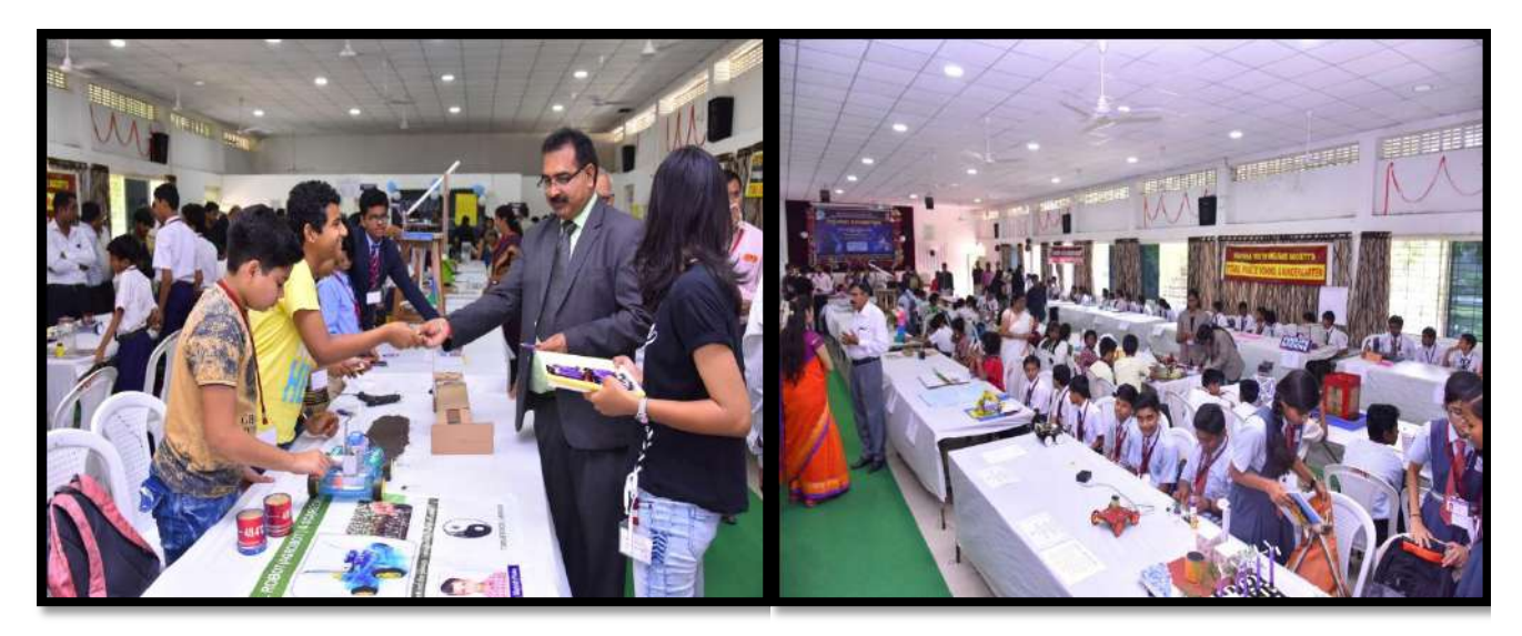
Techno Exhibition (Science & Tecnology Exhibition) for School Students from 5<sup>th</sup> to 10<sup>th</sup> standard