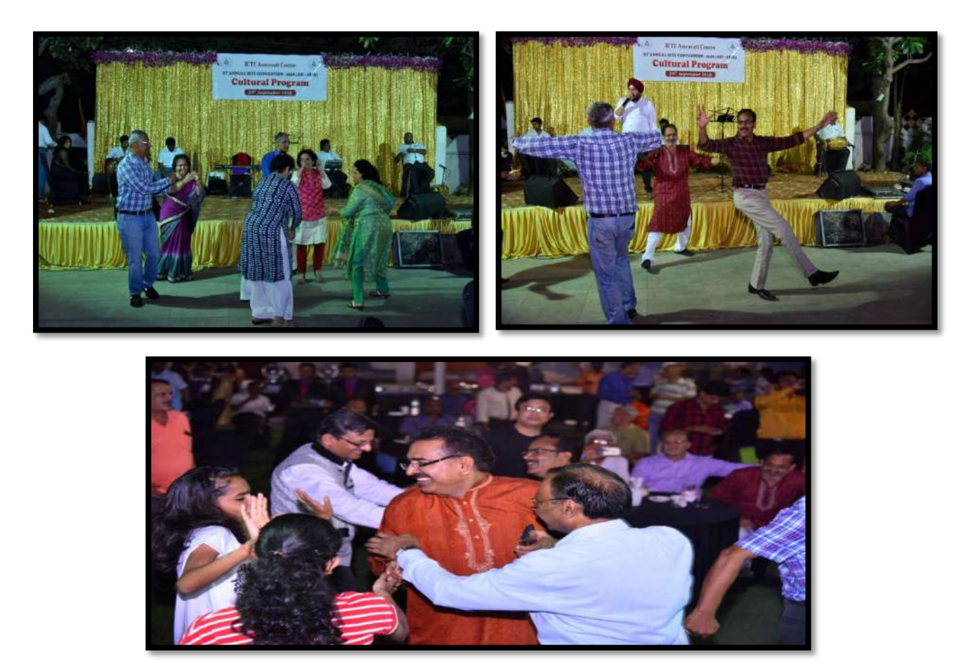
Cultural program by Amravati Center

Cultural programme by local artists form Amravati was highly appreciated. Culture programme is followed by dinner at the Grand Mehifil hotel. All the IETE delegates and Amravati center officer bearers have enjoyed the cultural programme and also took active participation in singing and dancing. The AIC culminated in special visit to various nearby tourist spots such as Shegaon, Chikhaldara and Muktagiri.